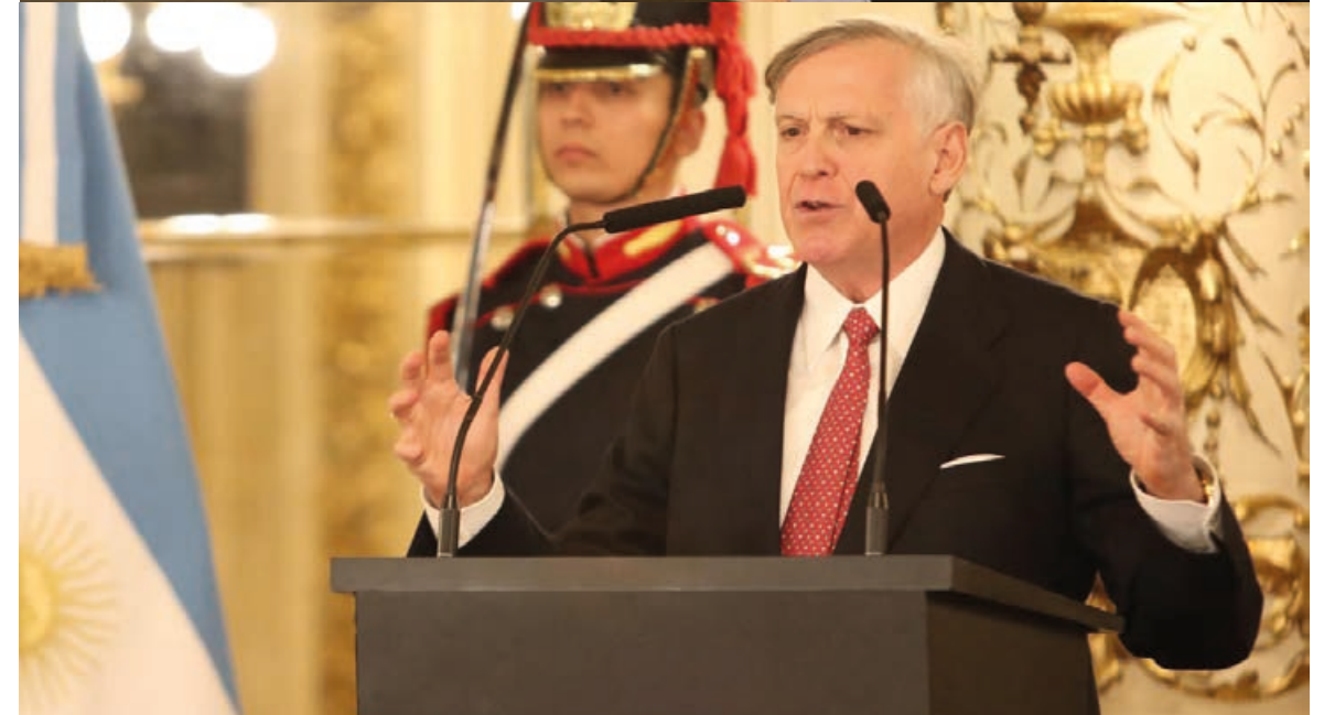
Above, the President of Argentina, Javier Milei, delivers his speech in honor of Professor Jesús Huerta de Soto, minutes before awarding him the Order of May Merit. Below, the Professor delivers his acceptance speech minutes later.