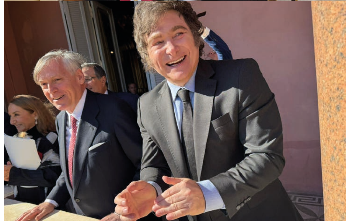
President Milei and Professor Huerta de Soto chat in the Casa Rosada alongside the former's iconic chainsaw, and then step out onto the balcony of the Argentine presidential palace.