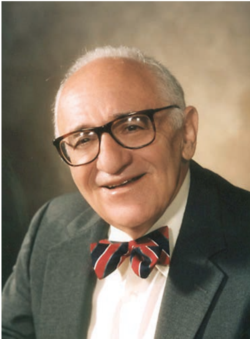
Murray Rothbard stated that there are two types of government services: those that should be eliminated and those that should be privatized.

Rothbard maintained that the set of goods and services the state currently supplies can be divided into two subsets: those goods and services which should be eliminated, and those which should be privatized. Clearly, the goods mentioned in the above paragraph belong to the second group, and the disappearance of the state, far from meaning the disappearance of highways, hospitals, schools, public order, etc., would mean their provision in greater abundance, at higher standards, and at a more reasonable price (always with respect to the actual cost citizens currently pay via taxes). In addition, we must point out that the historical episodes of institutional chaos and public disorder we could cite (for example, many instances during the years prior to and during the Spanish Civil War and Second Republic, or today in broad areas of Colombia or in Iraq) stem from a vacuum in the provision of these goods, a situation created by the states themselves, which neither do with a minimum of efficiency what in theory they should do, according to their own supporters, nor let the private, entrepreneurial sector do , since the state prefers disorder (which also appears to more strongly legitimize its