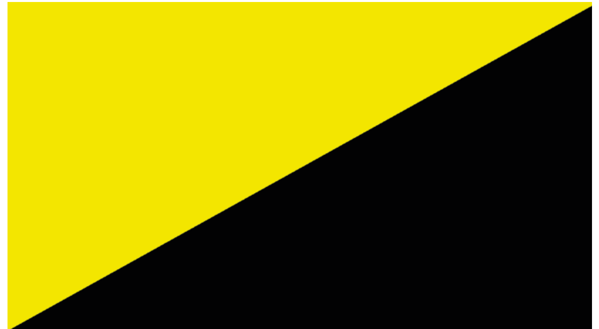
The so-called black and gold flag is the best-known flag of anarcho-capitalism, and uses gold to symbolize capitalism, instead of the red used by anarcho-collectivists.

the path to this important final result, we must use all of the peaceful 3 and legal 4 means that current political systems permit.