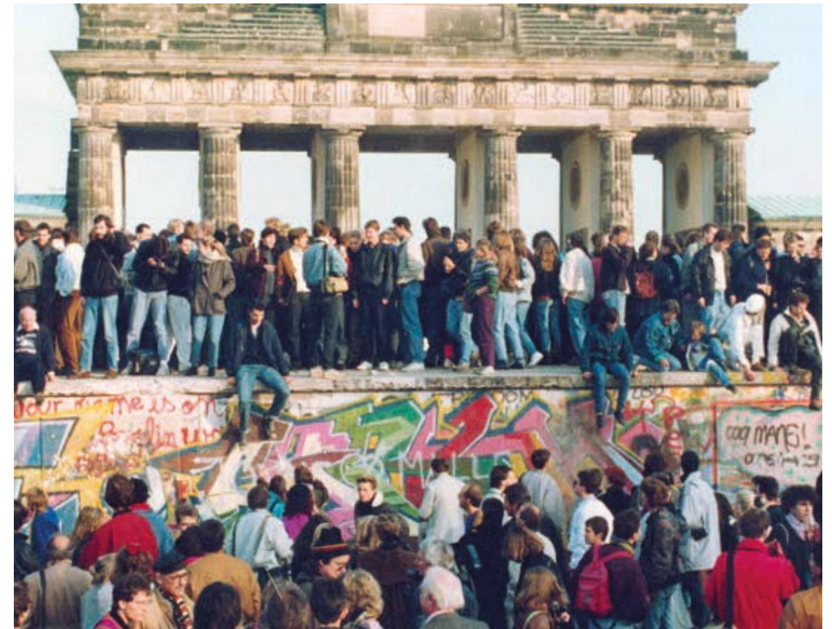
Despite the fall of the Berlin Wall, states have continued to grow and curtail individual freedoms in all areas.

It is absolutely necessary to overcome the “utopian liberalism” of our predecessors, the classical