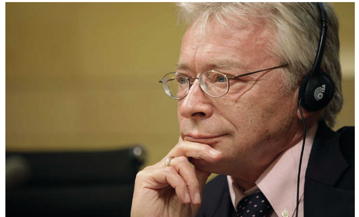
For Hans-Hermann Hoppe, the historical analysis is indisputable: the state has not stopped growing.

irrefutable: the state has not ceased to grow (Hoppe 2001). And it has not ceased to grow because the mixture of human nature and the state, as an institution with a monopoly on violence, is “explosive.” The state acts as an irresistibly powerful magnet which attracts and propels the basest passions, vices, and facets of human nature. People attempt to sidestep the state’s commands yet take advantage of its monopolistic power as much as possible. Moreover, in democratic contexts particularly, the combined effect of the action of privileged interest groups, the phenomena of government shortsightedness and vote buying, the megalomaniacal nature of politicians, and the irrespon-