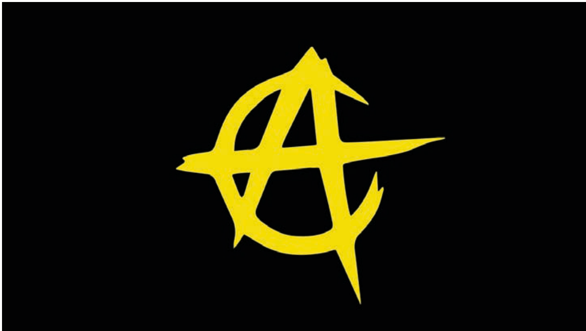
One of the main flags used by the international anarcho-capitalist movement, with its initials "a" and "c" in gold, the color of capitalism, on the black of anarchy.

but we must never slip into a pragmatism that forsakes the ultimate goal of putting an end to the state. For purposes of teaching and influencing the general public, we must always pursue this objective in a systematic, transparent manner 2 (Huerta de Soto 1997).