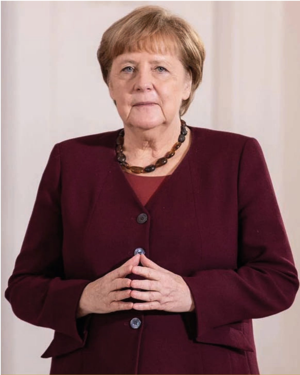
Angela Merkel (1954-).