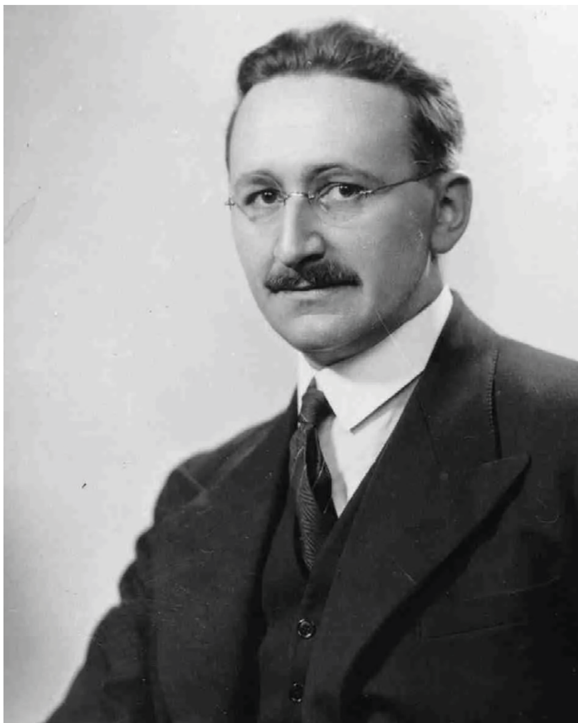
Friedrich August von Hayek (1899-1992).