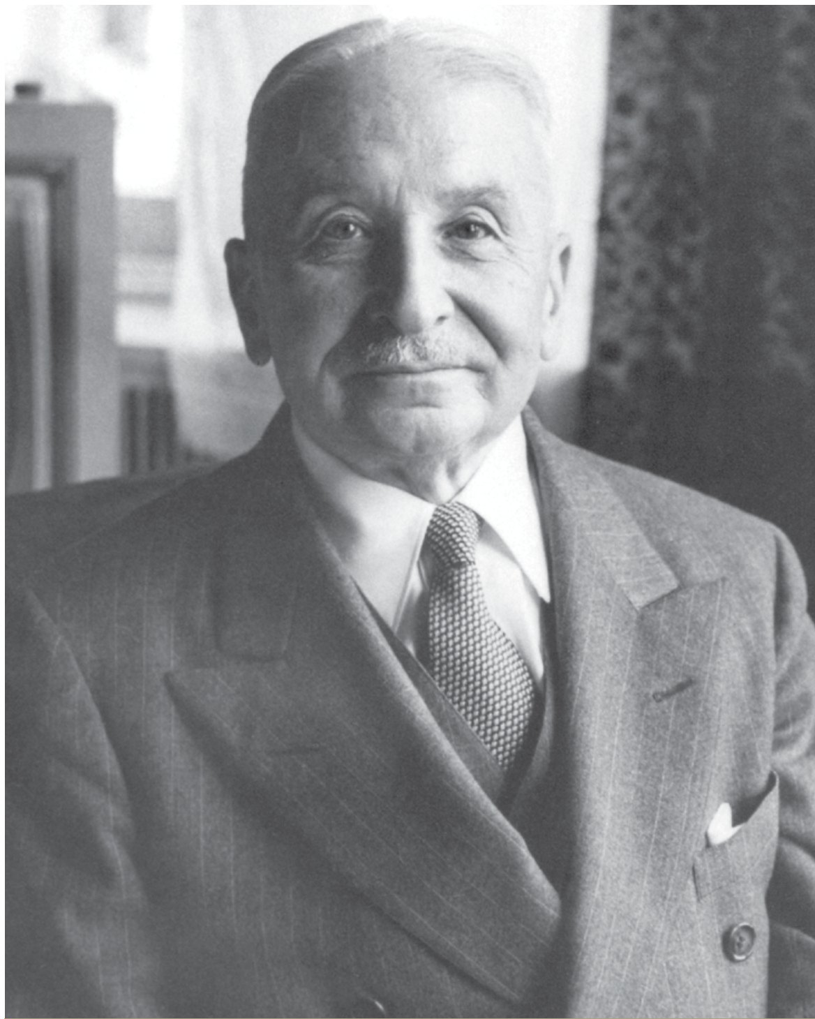
Ludwig Heinrich Edler von Mises (1881-1973).